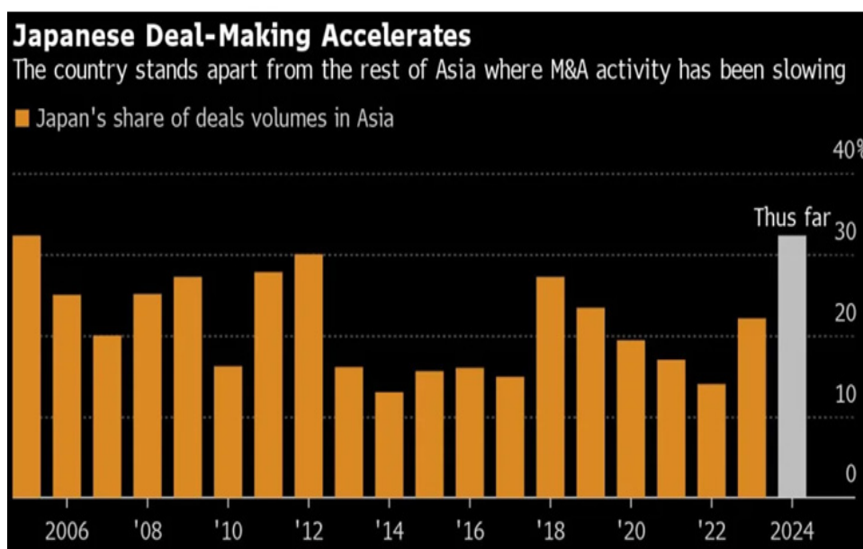
Figure 2: Japan Represents About One-Third of All Asian M&A Activity

Source: Bloomberg, Dealmaking Booms in Japan as Most of Asia Suffers through Bust , 2/21/24.