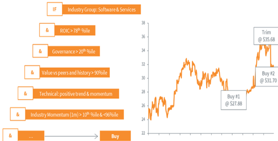
Source: Voya Investment Management. For illustrative purposes only. Hypothetical examples intended to illustrate the objective of the trading methodology. Not representative of a real investment or trading history and there is no guarantee the fund will be success in identifying success trades.

When the model identifies positive characteristics indicating a buying opportunity: such as cheap financial valuation metrics relative to peers and history, market sentiment indicating rebound, and positive technical indicators, the model enters a position in the particular company. As the model continually ingests new information and tracks the features representing the changing market conditions and dynamics of the company, it determines the best time to begin taking profits. In doing so, the model seeks to capitalize on these asymmetric risk/reward patterns.