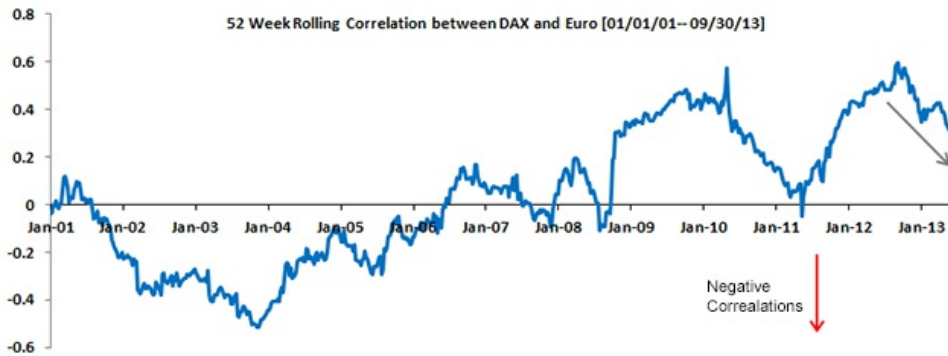
Past performance is not indicative of future results.

• In the five years following 2001, the correlation between the two asset classes was firmly in negative territory. • It appears that the correlation tended to spike in times of economic duress and uncertainty, as with the global financial crisis in 2008/2009 and the European crisis in 2010/2012. • The current trajectory of the correlation seems to indicate a decreasing correlation between the euro and German equities, which could motivate an increased focus on currency-hedged strategies.