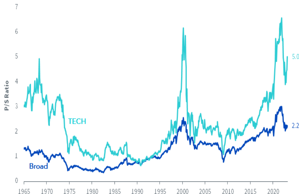
Figure 1: A Long Time Series Shows Three Distinct Peaks in Tech Stocks' Price-to-Sales Ratios

Source: Jeremy Siegel with Jeremy Schwartz, research for Stocks for the Long Run , 6th ed., 2022. Past performance is not indicative of future results.