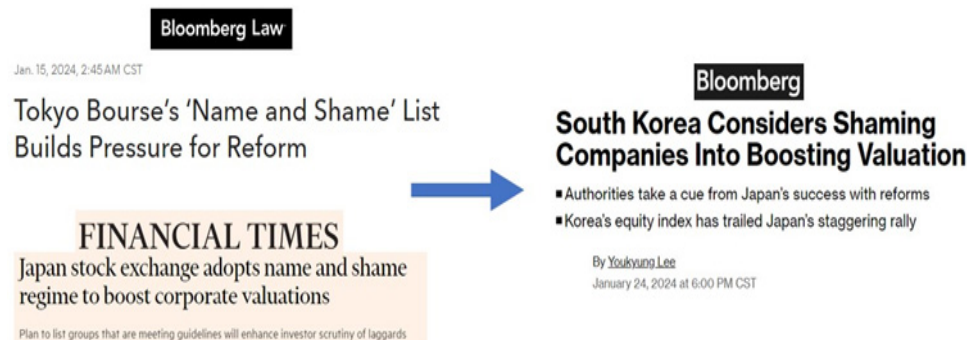
Figure 3: South Korea Is Playing Japan's Governance Card

This initiative has a specific title that I think will be splashing headlines all year: the "Corporate Value-Up Program." Whenever you want to Google Korea's reforms, type that into the search bar.