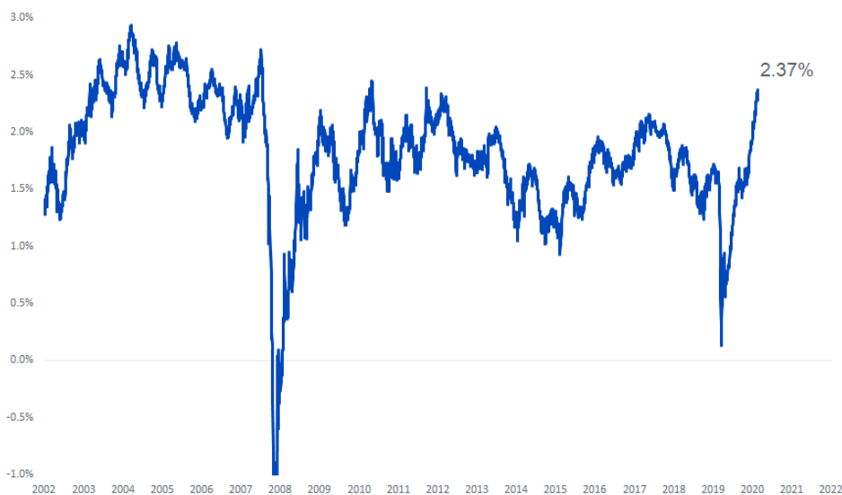
Figure 3: U.S. Five-Year Breakeven Inflation Rate