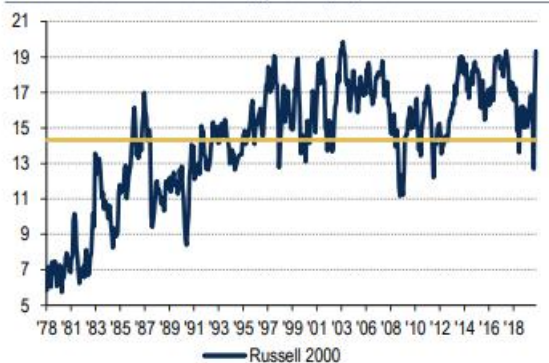
Chart 2: Russell 2000 Forward P/E, 1979-5/31/2020

Source: BofA US Equity & Quant Strategy, Russell Investment Group, I/B/E/S, Compustat.