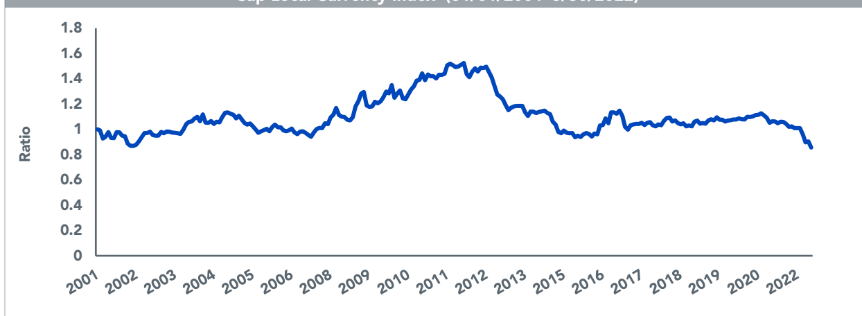
Figure 1: Currency Impact on Cumulative Returns of MSCI Japan Small Cap Index vs. MSCI Japan Small Cap Local Currency Index (01/01/2001–6/30/2022)

Ratio is computed by dividing MSCI Japan Small Cap Index by MSCI Japan Small Cap Local Currency Index. Past performance is not indicative of future results. You cannot invest directly in an index.