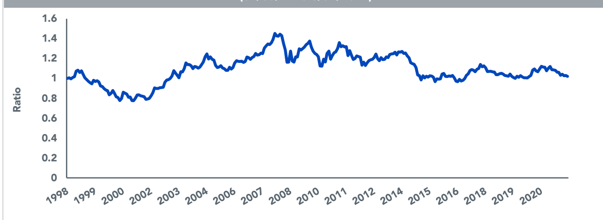
Figure 1: Currency Impact on Cumulative Returns of MSCI EMU Index vs MSCI EMU Local Currency Index (04/30/1998-3/31/2022)

Ratio is computed by dividing MSCI EMU Index by MSCI EMU Local Currency Index. Past performance is not indicative of future results. You cannot invest directly in an index.