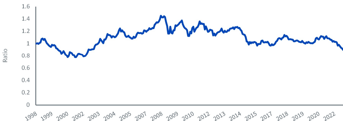
Figure 1: Currency Impact on Cumulative Returns of MSCI EMU Index vs MSCI EMU Local Currency Index (04/30/1998-12/31/2022)

Ratio is computed by dividing MSCI EMU Index by MSCI EMU Local Currency Index. Past performance is not indicative of future results. You cannot invest directly in an index.